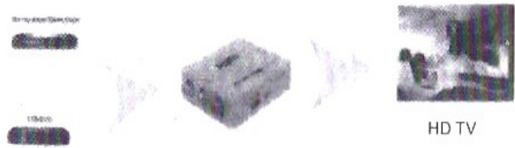
HDMI TO AV CONVERTER